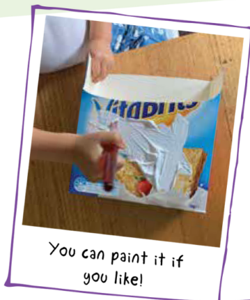
You can paint it if you like!

Ask your family if it's OK to do some gluing and painting. Then work out where you're going to do your fancy hat making, and cover that area with newspaper. This is REALLY important. Billie once forgot this step and accidentally glued a googly eye to the bench. Her mum and dad were NOT pleased!