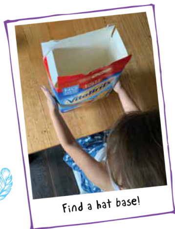
Find a hat base!