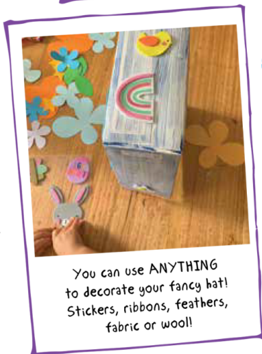
You can use ANYTHING to decorate your fancy hat! Stickers, ribbons, feathers, fabric or wool!

If you don't have any ribbon, see if there is some spare material lying around that you could cut up into strips. Ribbon looks great, because it flows in the breeze as you walk - very theatrical!