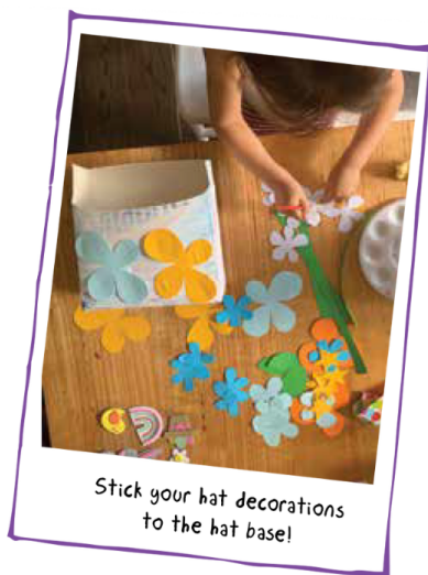
Stick your hat decorations to the hat base!