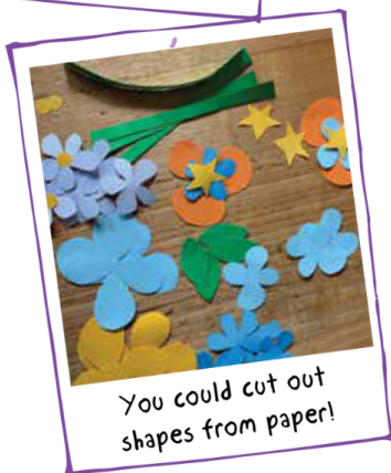
You could cut out shapes from paper!